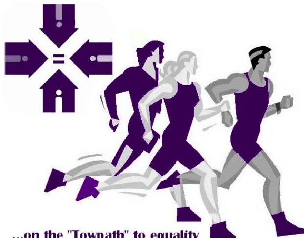
...on the "Towpath" to equality